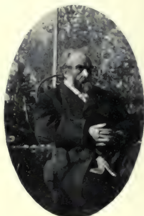
JEAN BAPTISTE ANDRÉ GODIN.

of his "To offer to the workman the equivalents of riches." Here are comfortable dwellings, many common wants provided for, education full of care for the children and the young people, festivals and rejoicings for all, assurance for the needs of the morrow, and complete liberty for the workman to dispose of himself and of his leisure as he will. Finally, a charm added to life by the most diverse social organisations, and by all that nature offers to the fortunate ones of this world.